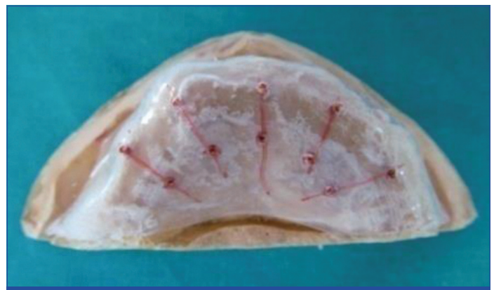
[Table/Fig-4]: Marks transfered on the cast.

Border morphology of the sulcus of each section was viewed and photomicrographs of these were taken with camera under a stereomicroscope with a magnification of 10x and zoom of x1 [Table/Fig-6-9]. The area ( \mu m<sup>2</sup>) was measured on an image analyser (LEICA). The average measurement of total area for all the six sections was taken as the final measurement for that material in those patients.